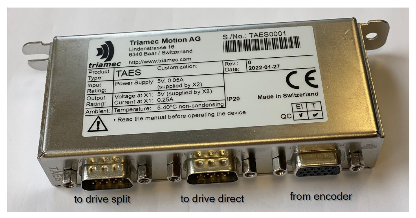
Figure 1: Image of the TAES encoder splitter with information tag.

With the help of a TAES encoder splitter, an encoder cable, and therefore an encoder signal, can be split into two, allowing the encoder signal to feed two different systems.